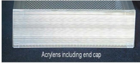
Acrylens including end cap